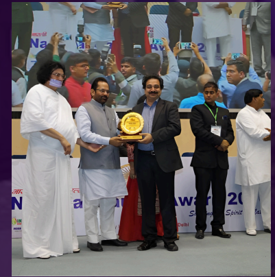
AWARDED FOR EXCELLENCE

Role-plays, case studies, and country-specific job drills