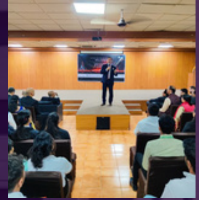
AUDITORIUM / SEMINAR HALL